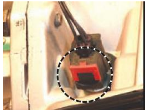
RED LOCKING TAB